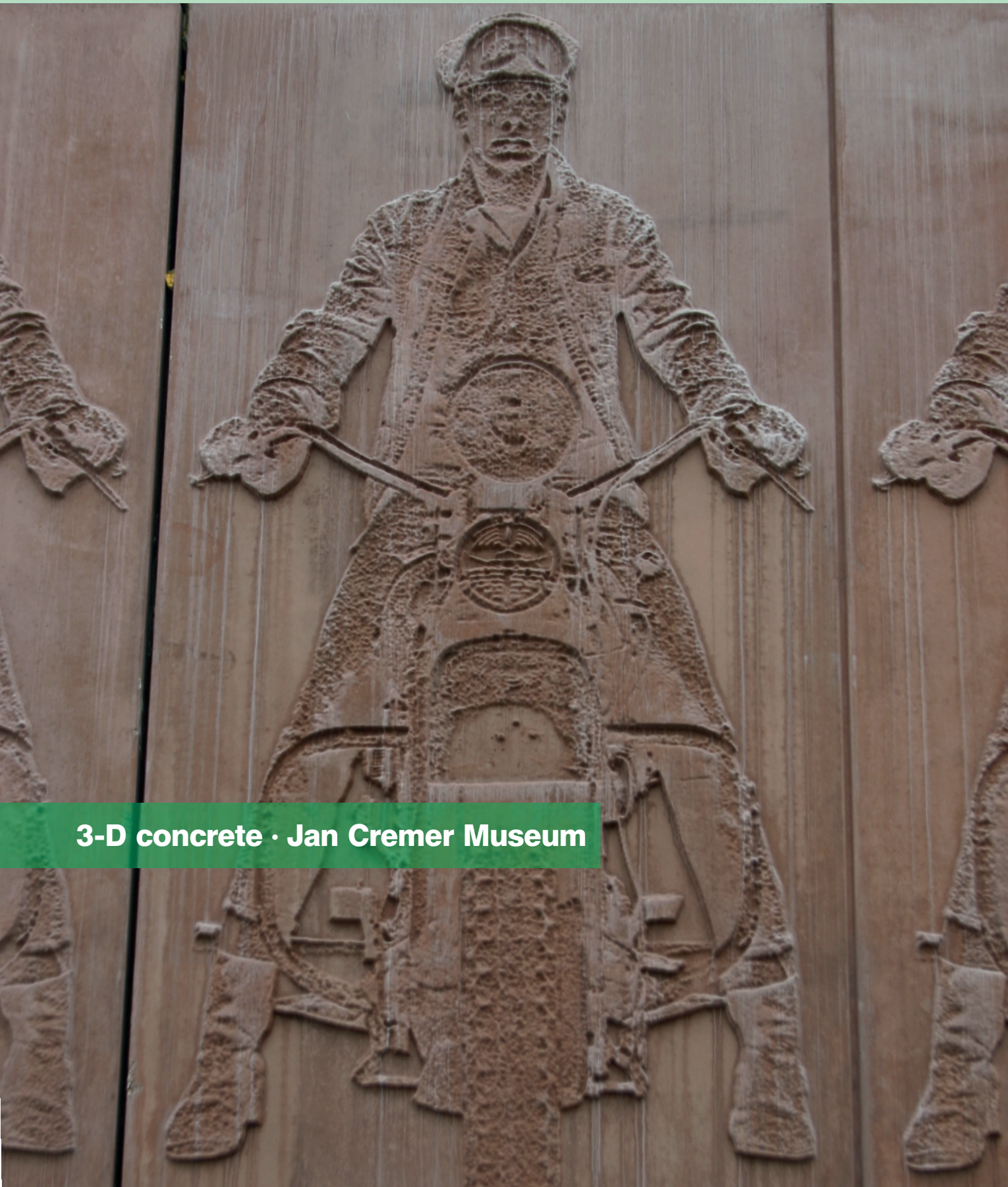
3-D concrete · Jan Cremer Museum